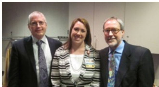
APRIL LUNCHEON SPEAKERS

Our Board of Directors has worked hard to provide information and to educate our members and prospective members. If you are not a member yet, please consider joining our League.