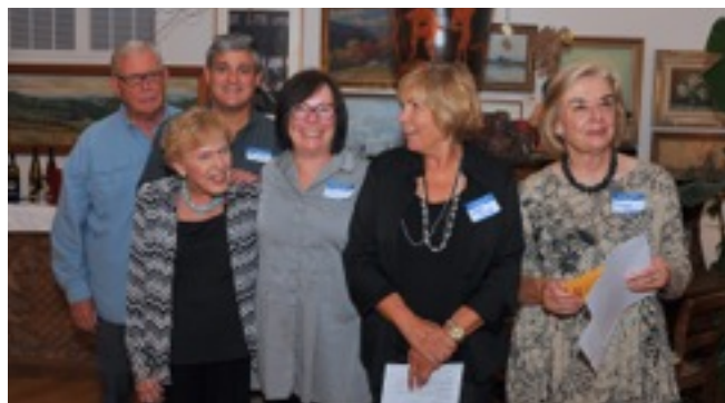
EVENING AT THE GALLERY